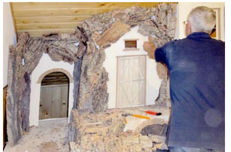
Nelle foto: Xaosjnsooc asc asuch aisouch