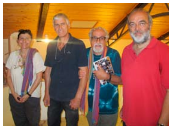
Nelle foto: Xaosjnsooc asc asuch aisouch