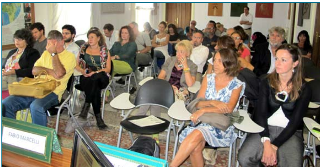
Nelle foto: alcuni momenti dell'incontro

Coorganizzato dall'Associazione Nazionale Giuristi Democratici, si è svolto presso la Sala Vesuvio della Fondazione Mediterraneo l'incontro internazionale "Giuristi contro le guerre". In questa occasione la Fondazione ha presentato l' Appello per la Pace in Siria .