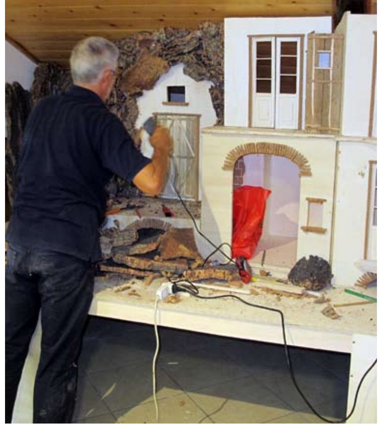
Napoli | 13 settembre 2013