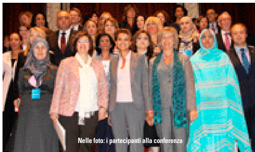
Nelle foto: i partecipanti alla conferenza